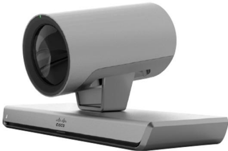
Figure 1. Cisco TelePresence Precision 60 Camera