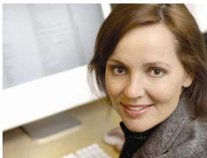
Live Video Operators

The Cisco TelePresence™ portfolio creates an immersive, face-to-face experience over the network—empowering you to collaborate with others like never before. Through a powerful combination of technologies and design that allows you and remote participants to feel as if you are all in the same room, the Cisco TelePresence portfolio has the potential to provide great productivity benefits and transform your business. Many organizations are already using it to control costs, make decisions faster, improve customer intimacy, scale scarce resources, and speed products to market.