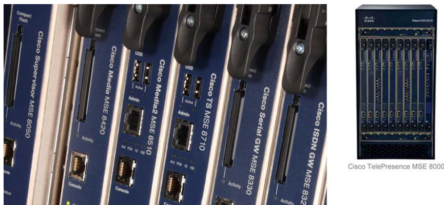
Figure 1. Cisco TelePresence MSE 8000